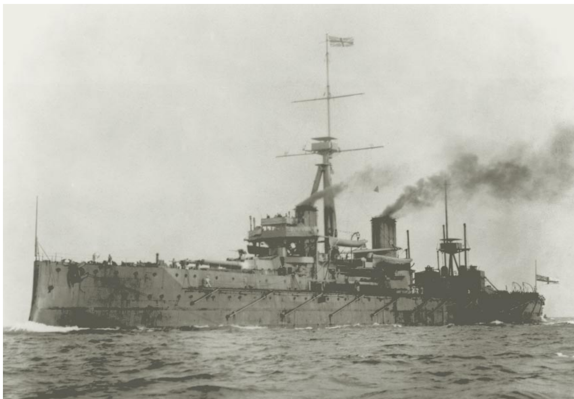
HMS Dreadnought underway.