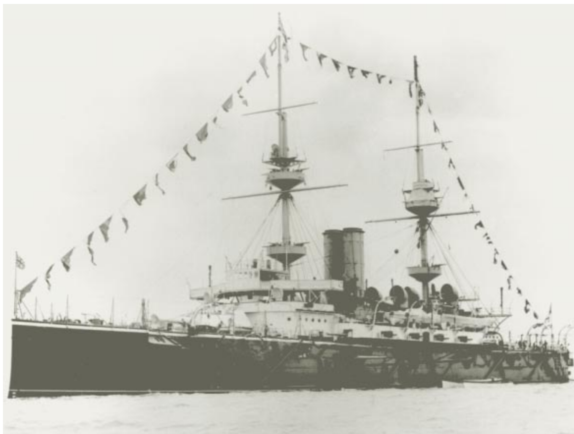
HMS Illustrious , coal-fired cruiser launched in 1896.